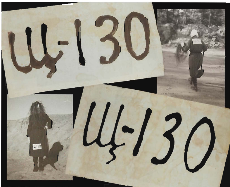
A woman repairing the Trans-Siberian Railroad (Elena Juciūtė).

In the photograph she is resting amongst the stumps that she had been toiling at.