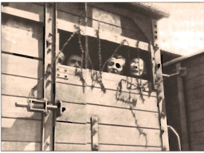
OPPOSITE PAGE: A brigade of deported Lithuanian women working on the Trans-Siberian Railroad in the Tiumen region of Siberia, 1954; ABOVE: This is the way deportees, men, women and children, were transported to the slave labor camps of Siberia—worse than cattle.

numbers of deaths due to Stalin's brutality far exceeded those of Hitler. His death machine functioned at the same time as Hitler's and in the same geographic location, but produced many more casualties.