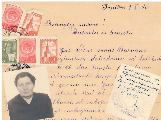
Four dollars for one egg, seventy for a pound of butter (Abromavičius).