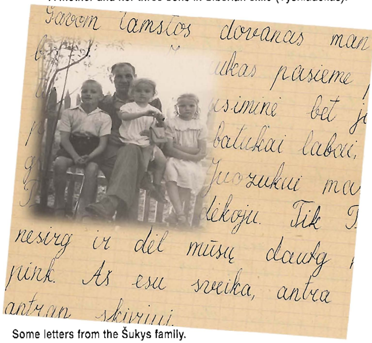
Some letters from the Šukys family.